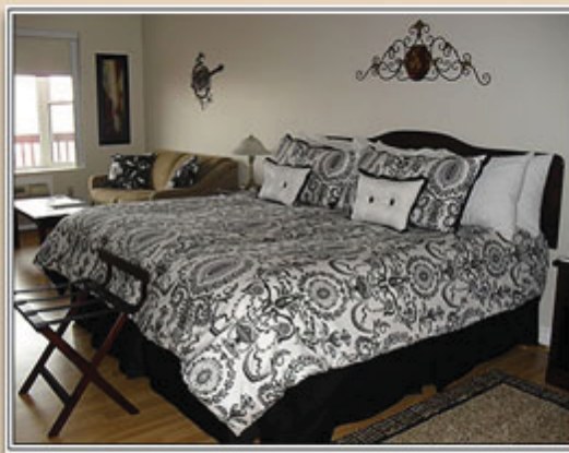
Suite #5 & 8