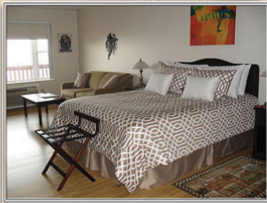
Suite #6 & 9